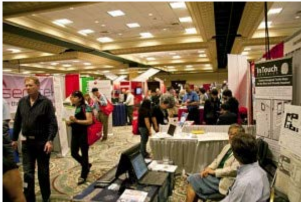
Attendees of the annual International Technology and Persons with Disabilities Conference.

Over six days in San Diego, thousands of people from around the world gather for California State University, Northridge's annual International Technology and Persons with Disabilities Conference. A pioneering idea now in its 27th year, the conference is the world's largest event of its kind, and the only one sponsored by a university.